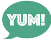
1 Pantone colour